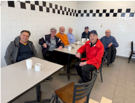
Coffee time on the first Thursday of each month at Persian Man on corner of Central and Tungsten