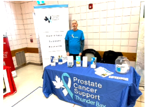
Booth at 55 Plus Health Fair on March 28th 2026